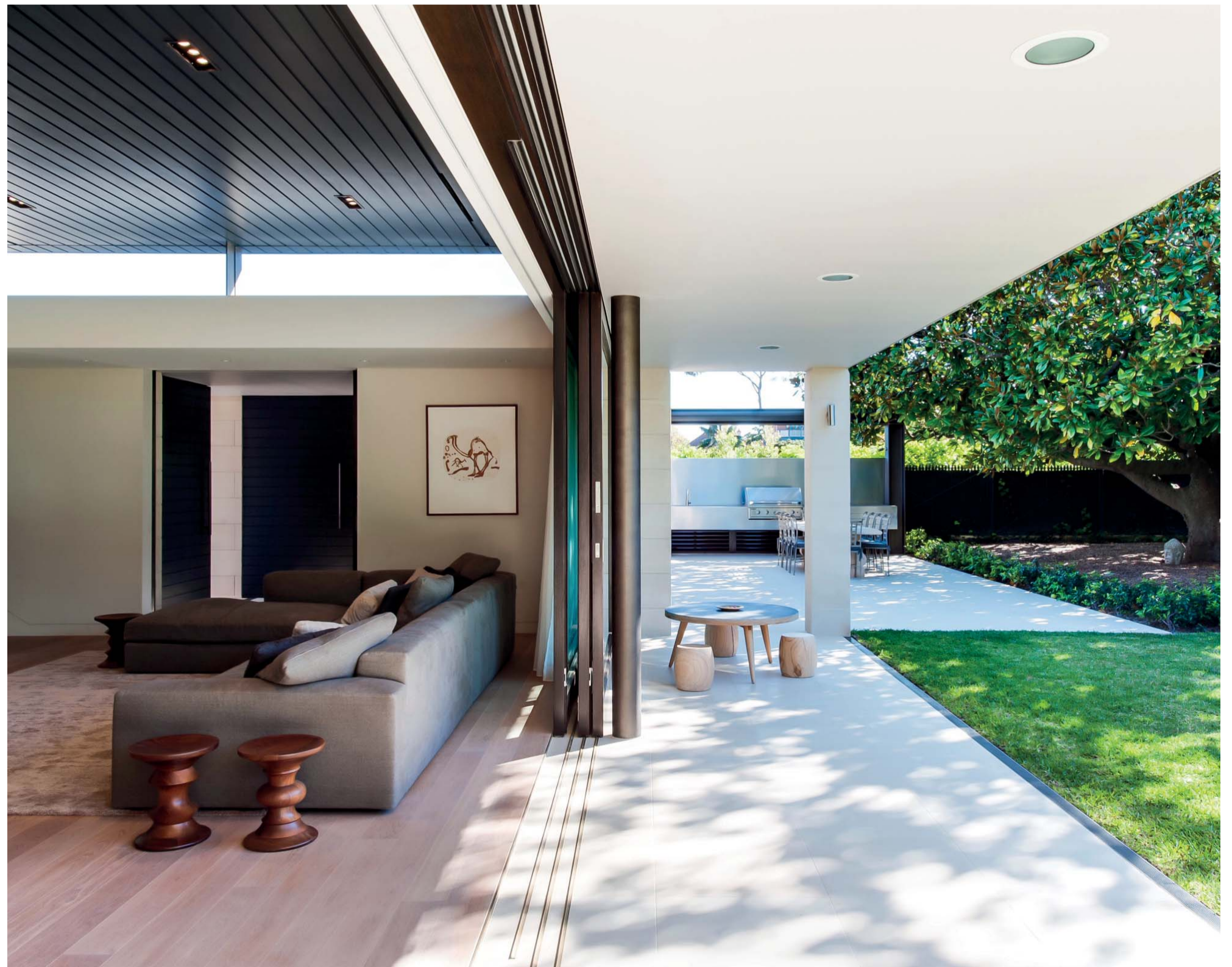
The main living area opening seamlessly onto a level lawn and dense landscaping