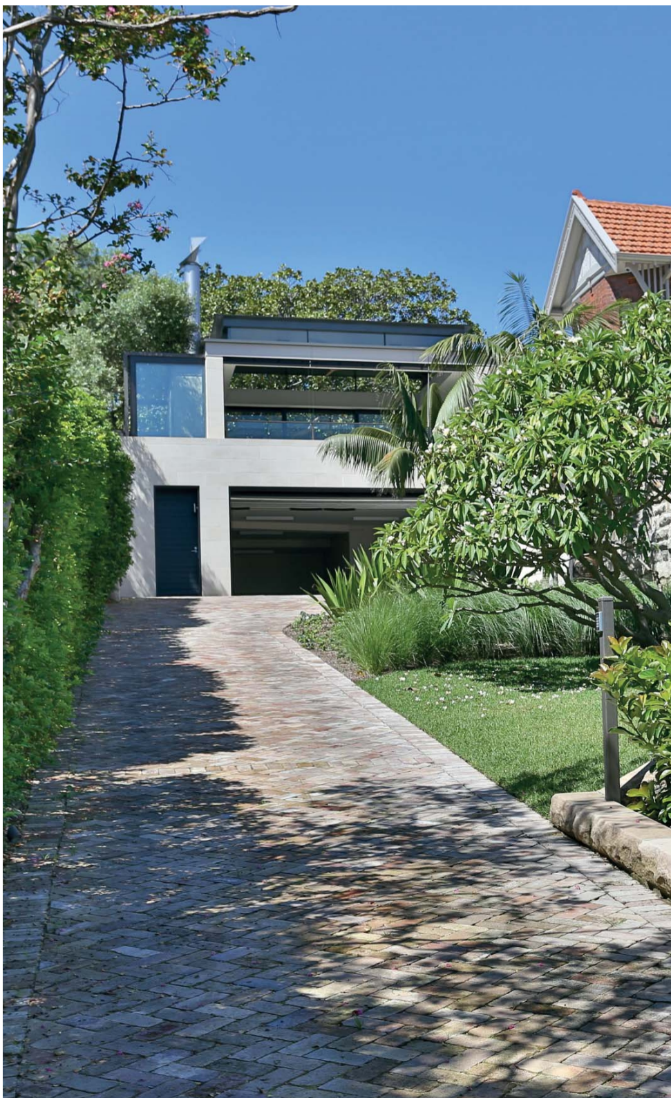
Contemporary Northern Pavilion